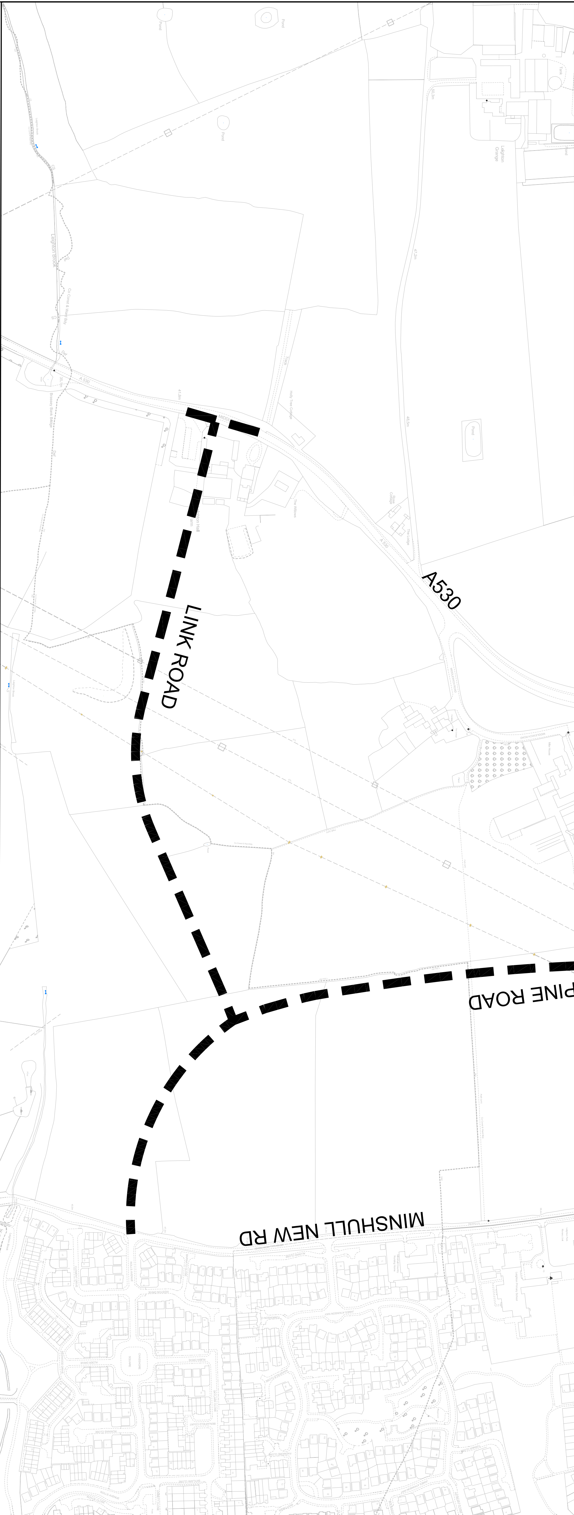
Site Layout Scale 1:2500